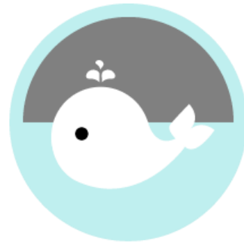
SECONDARY LOGO (WITH COMPANY NAME)