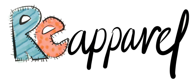
Refit - Resize - Reuse