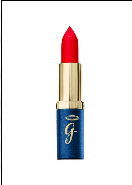
Pepper Spray Lipstick