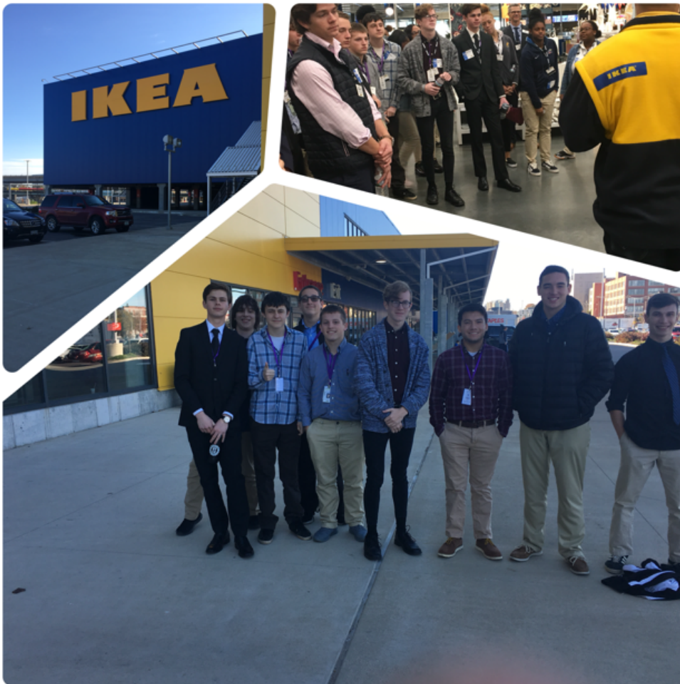
Timber Tones Employees performing market and business research at a local IKEA

Here at Timber Tones we pride ourselves on being an Eco-friendly company that thrives on helping the environment around us. One way we help out is by donating a percentage of our profit to foundations which plant trees in rural area and reforesting patches of our country. We are able to do this through our partnership with the Arbor Day foundation, a non-profit organization that helps plant trees all around our planet. This month we have planted 27 sweet gum trees in the rural areas of southern Illinois . With the trees planted this early in our companies creation we are left with a relatively low carbon footprint and we hope to soon entirely eliminate our carbon footprint and move onto working with Renewable Energy Foundation to go green.