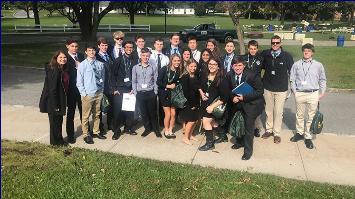
A Lil Twist and Outlast Outerwear at the Long Island University Elevator Pitch Competition on October 19, 2018