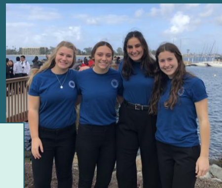
Marketing having fun in San Diego!

We sold $30,000 worth of products. The company earned second in the Sales Materials competition, third for the video competition, silver in radio commercial, silver in Impact Marketing, and silver for Salesmanship. Keep the good work up!!