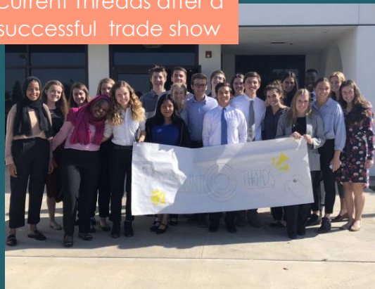
Current Threads after a successful trade show