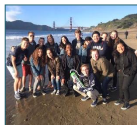
Current Threads visiting the Golden Gate Bridge