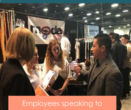
Employees speaking to prominent business owners in the community

If you have any questions, please see the H.R. department.