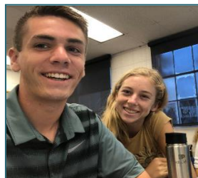
We love our HR specialists!