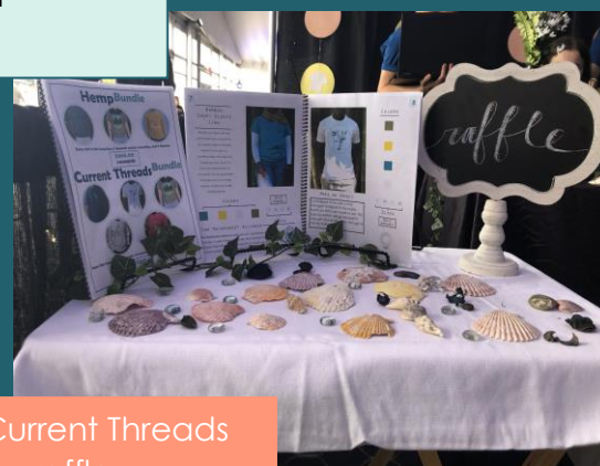
Our Current Threads raffle