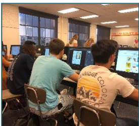
Sales department creating the product lineup

The Great Pacific Garbage Patch is now more than twice the size of Texas according to The Ocean Clean Up.