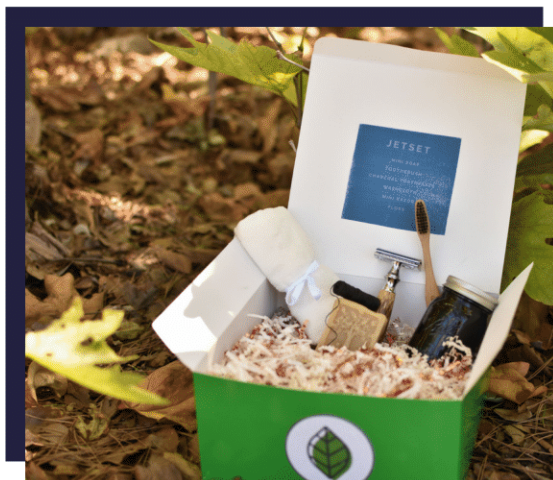
Our Jetset Kit retails for $29.99.

Are you ready for your trip? In a report by AAA, it is forecasted that the 2018 Thanksgiving travel season will be at an all-time high with more than 50 million travelers. To us, this means 50 million people will be stressing about what to pack. Luckily for you, Ecocentric has just the solution to relieve some of that stress. One of Ecocentric's best selling products is our Jetset Bundle, and for good reason, too. For less than $30, this bundle comes with all your everyday essentials when on the go. All packed in a recycled-plastic pouch, this bundle includes charcoal toothpaste and floss, a bamboo toothbrush and washcloths, and mini natural soaps. You will have everything you need for your trip. Also, unique to the Jetset Bundle is the sizing of