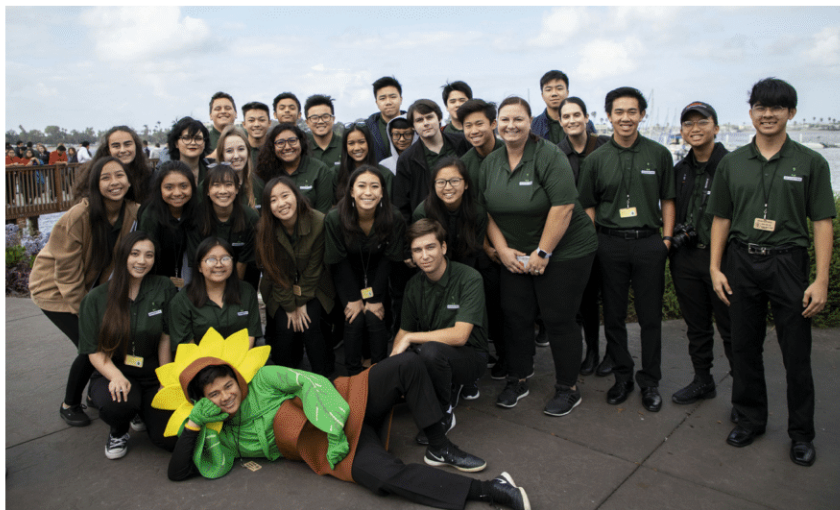
All smiles in San Diego.