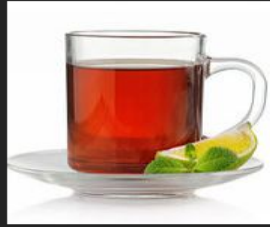
Mountain Fresh Tea