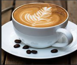
French Vanilla Blend