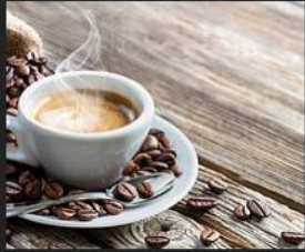
Coffee ³ Signature blend