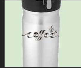
High Tech Rechargeable Thermos