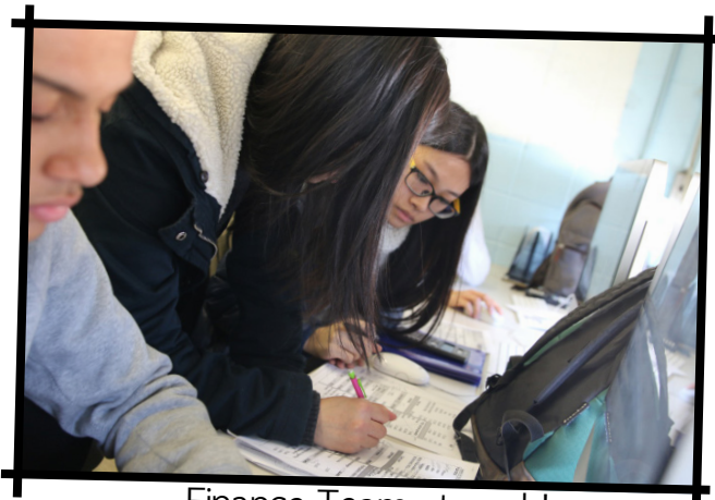
Finance Team at work!