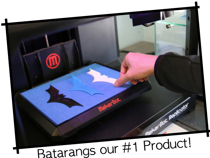
Batarangs our #1 Product!