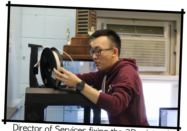
Director of Services fixing the 3D printers!