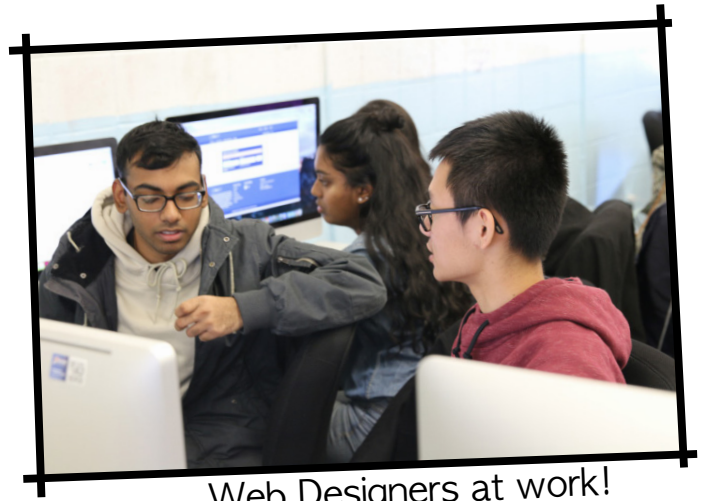
Web Designers at work!