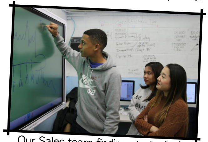
Our Sales team finding strategies!