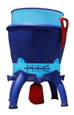
Pure© Field Filter- $199.99

Ideal for any athletic team or group outdoor activity. This product filters water to hydrate athletes with the purest water for ultimate performance.