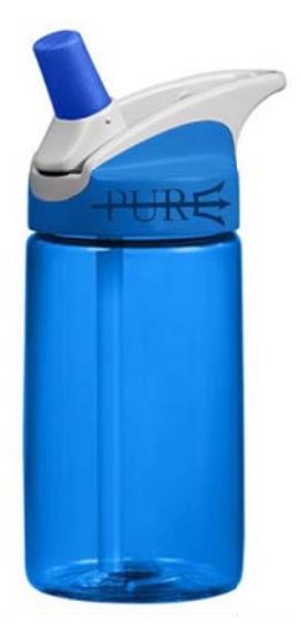
Pure© Youth Water Bottle- $24.99

The perfect water bottle, with the same filtration system as the Pure Water Bottle, to keep your child healthy and safe.