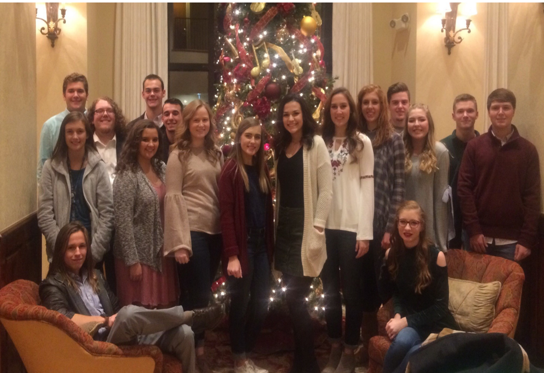
Our Employees at The Southern Tennessee Regional Trade Fair