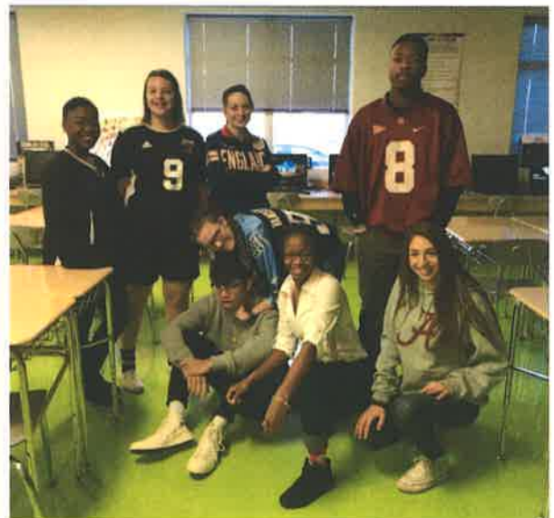
Homecoming Athletes v.s. Mathletes