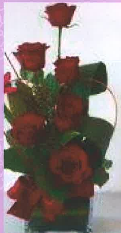
6 Red Roses For a Great Deal $25.00