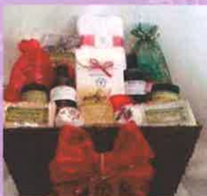
Spa Day Gift Set For Her! Only $60.00

Cozy Co. focuses on our consumers wants and needs, as the holidays continue we have special buddles and gift sets at great prices.