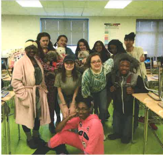
Homecoming Elderly v.s. Youth

Cozy Co. employees enjoy being able to have fun while still accomplishing goals!