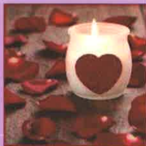
Heart Candle! Only $25.00