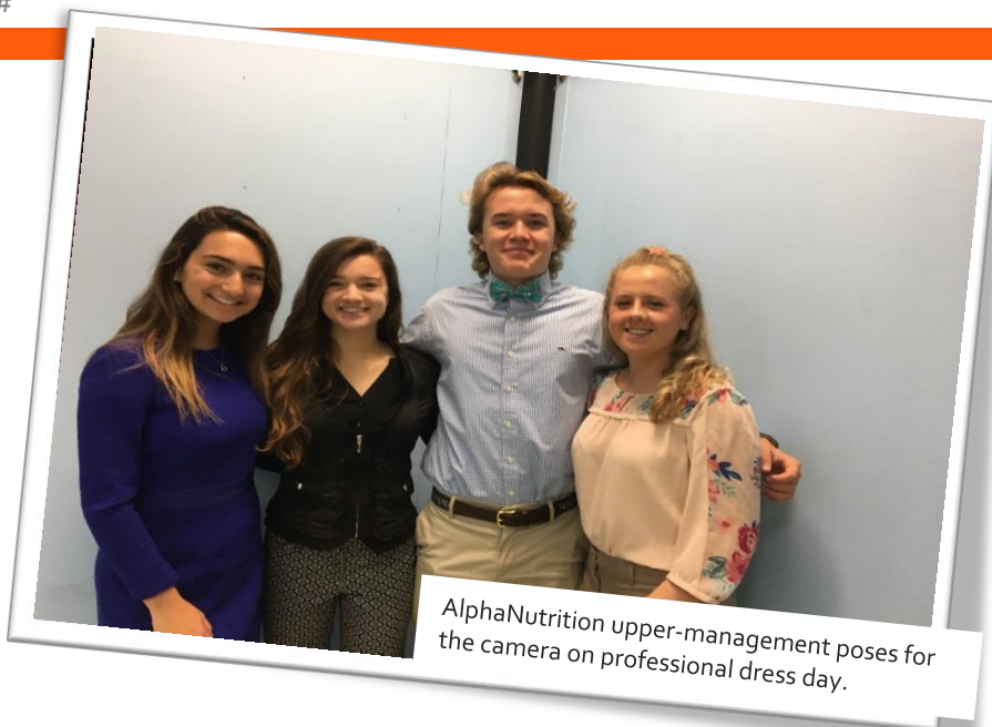
AlphaNutrition upper-management poses for the camera on professional dress day.