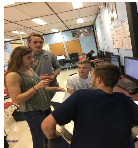
Executive management diligently guiding the accounting department.

AlphaNutrition is a functional organization of 19 diverse, passionate and goal driven employees. Our executive management team formulated an ideal work environment, placing the most apt individuals in departments where they could thrive. Since then, we've held meeting after meeting to create a business that encompasses all that we believe in: the possibility of a better lifestyle for all people, of all ages, and at an affordable cost. To raise capital for the startup of AlphaNutrition, we began with out-of-network sales to interested customers and have presented to our Angel Investors to ensure a solid foundation. We will also be attending trade shows, consulting further investors and have begun sending email blasts to inform customers of the outstanding deals we offer throughout the month. We have been utilizing social media, such as Instagram and Twitter, to promote our budding company, draw attention to the enthusiasm within our workplace and inspire our customers.