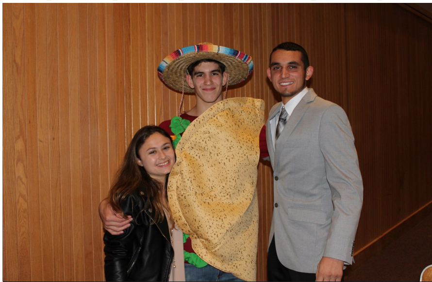
Some of the Guac-O-Taco Team