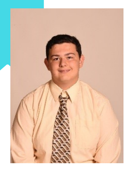
Congratulations January's Employee of the Month and Employee Spotlight